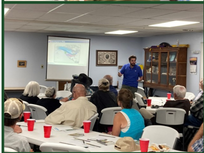
Speakers inform attendees of how weather extremes may affect crops.