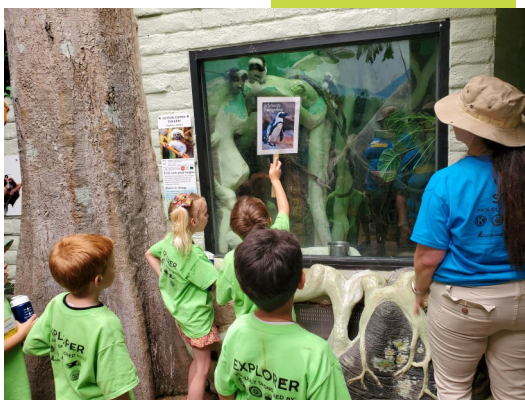
Top to bottom: Campers painted houses for feral cats; were introduced to farm animals; played group games, explored the zoo.