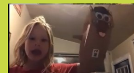
Sack puppets filled with supplies