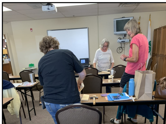
Participants create a take-home habitat for pollinators

This past fall, Horticulture Agent Sherie Caffey hosted three classes that all had to do with pollinators and creating a habitat for them in the home garden. The classes were titled Helpful Habitats for Pollinators. Each class was composed of a lecture portion and a hands-on portion where attendees made a habitat for the specific pollinator to put in their garden at home. The lecture part combined with taking a habitat home almost guarantees that attendees will be using their new knowledge at home.