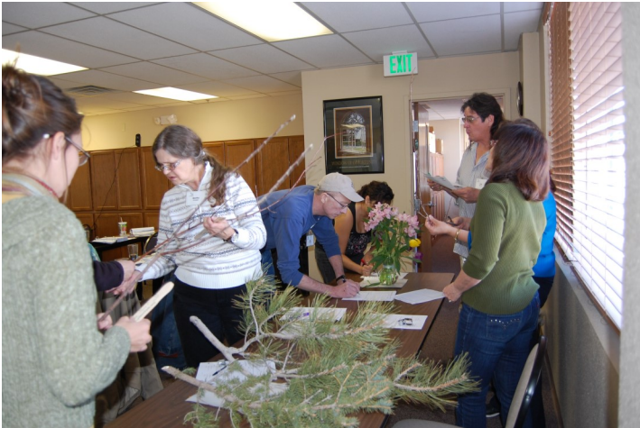
Apprentice Master Gardeners training on tree diseases.

Currently, the CSU Extension Horticulture program is getting ready to onboard a whole new group of Master Gardeners. Colorado Master Gardener volunteers are trained in research-based horticulture by CSU Extension staff. Trainees, referred to as Master Gardener Apprentices, receive ten weeks of online and in-person education that prepares them to educate the public on all things gardening.