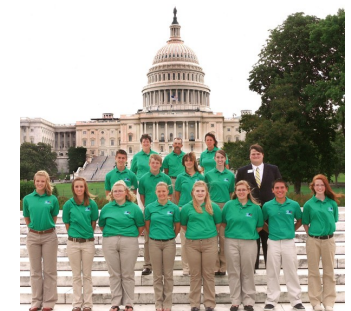
Trips & Leadership