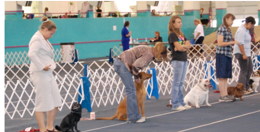
Dog Obedience, Showmanship and Rally