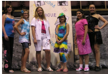
Clothing Design & Modeling