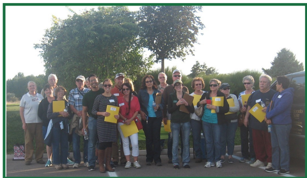
This group of participants is "all smiles" as they head out to identify native plants on the CSU-P campus.

native ecosystems. The NPM program here in Pueblo will be starting strong next Spring with formal outdoor courses and preparatory classroom style courses. You can contact the CSU Extension office in Pueblo County for more details. We hope to see you on the trail!