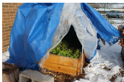
Lettuce and other greens continue to thrive using tarps and Christmas lights for protection and heat.

After the class, most of the materials were donated to the community garden. The community garden has put the new materials to good use. The wooden bed was installed in its winter location along the south wall of the church. Hoops were installed and used for shade cloth while greens and root crops germinated in the heat of September. By October, nighttime protection in the form of clear plastic was added. And while the crops were doing very well with limited protection in October, the community gardeners prepared for the cold weather to come. Tarps were purchased and Christmas lights were installed to protect the young crops.