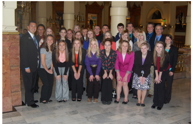
2015 LDC Delegation

In 2014 more youth signed up for participation in these leadership opportunities than ever before. The Leadership Development Conference (LDC) in Denver this January more than doubled in size from 2014. Without the help of these dedicated volunteers that comprise the 4-H Parent/Leader Group in Pueblo County, youth and leaders would not have the educational opportunities that are provided to them.