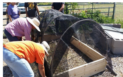
CSU Extension-Pueblo County held a Season Extending gardening class.

On September 6, 2014, CSU Extension-Pueblo County held a Season Extending gardening class at the Miracle Community Garden. Participants built a wooden bed and installed the hardware needed for hoops, built cold frames with straw bales and concrete blocks, and bent conduit for covers for different sized beds. They also learned how to build a hot bed by burying fresh manure and then constructing a cold frame around the bed.