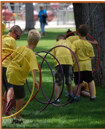
Outdoor fun with the CSU-Pueblo ropes course