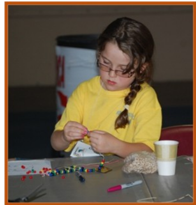
Camper enjoying a craft in 2012

Camp is scheduled for August 5th, 6th, and 7th. The first two days of camp will be held at the Colorado State Fairgrounds where the campers will learn about alternative energy, natural resources and conservation through a series of ten workshops that relate to our theme, "The Forces of Nature". We will also be collecting new baby items for foster parents who are often notified of their newborn's arrival with very little time to prepare. We will donate these items to the Pueblo Department of Social Services. For our community service project we will be creating activity kits for children with health issues that require hospitalization and need little projects they can work on in bed.