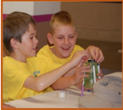
Campers make new friends.