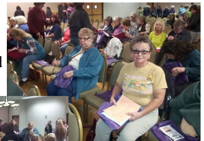
Participants had a choice of breakout sessions.

Each participant at the symposium is asked to answer a short survey and the committee considers their responses when planning the next event. In 2014, the survey results indicated that 66 percent of the participants had attended the event in previous years and that 92 percent intend to come next year. The WLS planning committee is actively planning for another successful symposium in 2015.